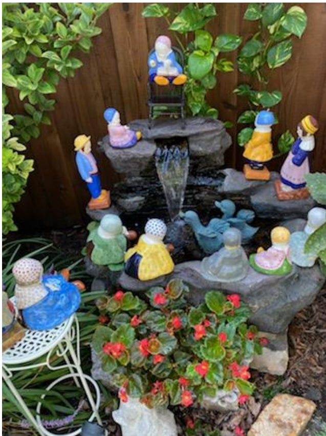
#1 School outside by fountain because of the Covid