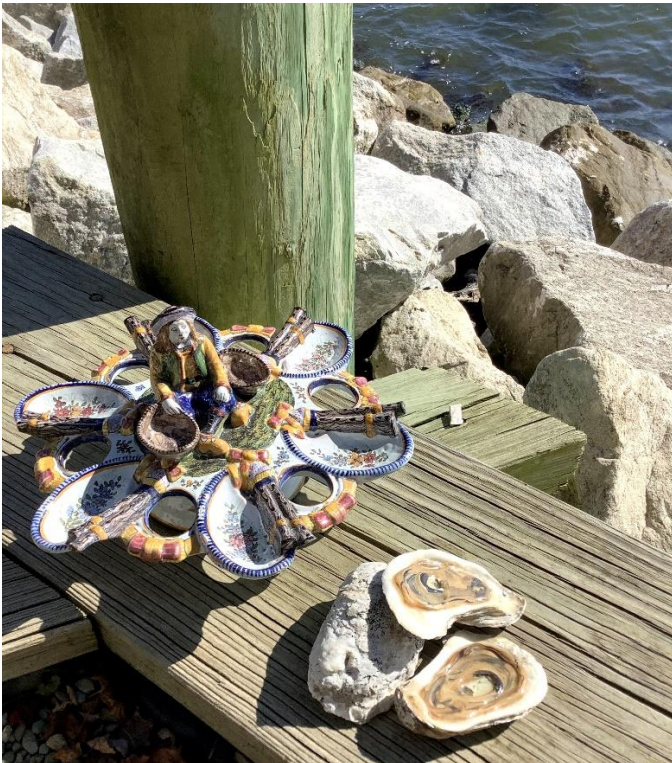
#2 May Frances Ramsey: Oysters, anyone? (Clearly Facebook users are food and drink aficionados!)