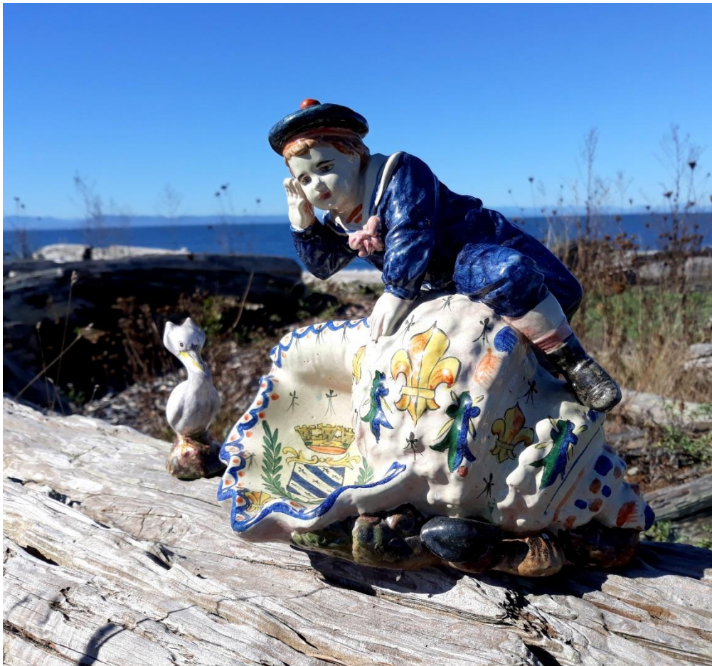
#3 : Do you hear what I hear?