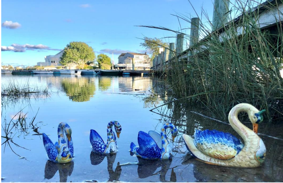
#2 Family outing on Cape Cod